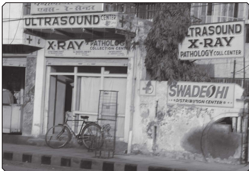
Medical clinics along the road felt a bit primitive

Unfortunately, that night brought problems. Belinda found herself unable to eat or pass foods — both classic signs of another total bowel obstruction. A physician who came to our hotel room inserted an NG tube into her stomach through her nose, then hooked her up to intravenous feeding, fluids and pain medication. Belinda rolled back and forth trying to get food to pass through. I treated her, but this time things went very differently. During treatment both of my hands were being pulled toward a single point in her intestines that felt hard, and hot; it felt like an infection.