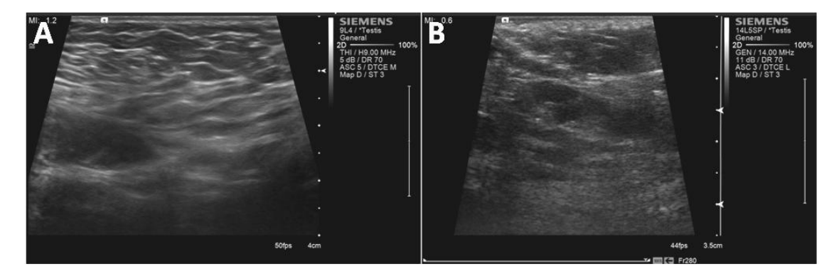
Figure 2. Adhesion deformation via transverse ultrasound imaging of the scrotum. (A) Before therapy: thickened scrotal wall with complex echogenicity. (B) After treatment: improvement in the scrotal wall and echogenicity.<sup>4</sup>